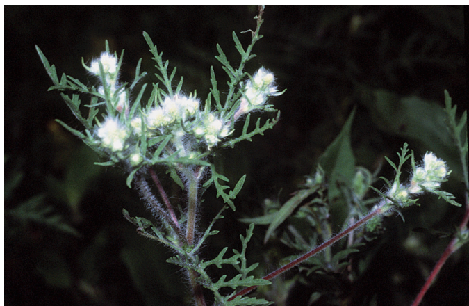
Superweed. Increased atmospheric CO 2 , the main fuel for photosynthesis, means more pollen, though not necessarily bigger plants.