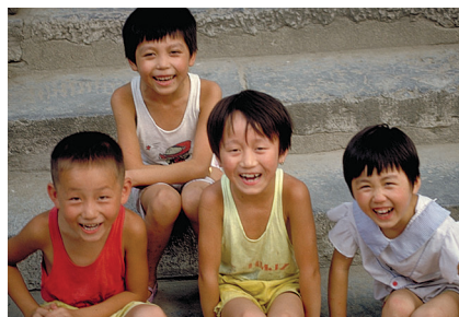
Kid-friendly gas. Phasing out leaded gas is one step toward lower blood lead for Chinese children.

Whatever the source, the Chinese government appears serious about reducing children's risk. Government officials, alarmed by results of the Shenzhen and other studies, plan to launch a nationwide lead survey of 8–10 million children, according to the Times article. "People are making great efforts to improve the environment," Wang says. "There'll be tremendous changes." — Cynthia Washam